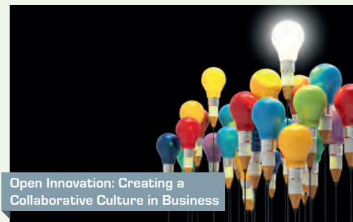
Open Innovation: Creating a Collaborative Culture in Business