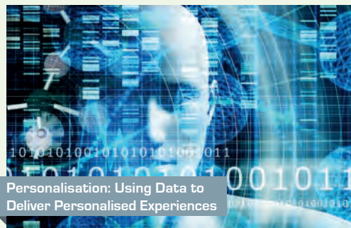
Personalisation: Using Data to Deliver Personalised Experiences