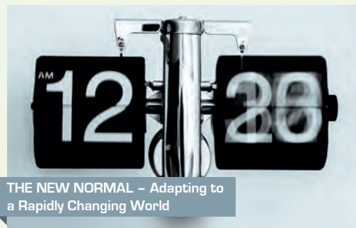
THE NEW NORMAL - Adapting to a Rapidly Changing World