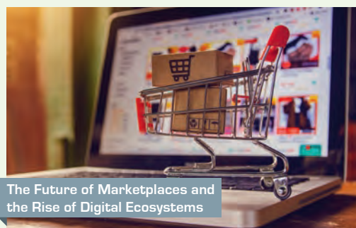
The Future of Marketplaces and the Rise of Digital Ecosystems