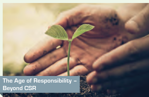
The Age of Responsibility - Beyond CSR