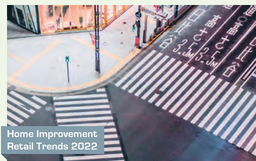
Home Improvement Retail Trends 2022